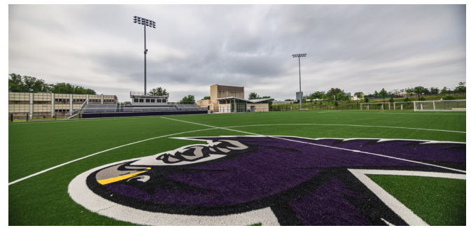
14 2021 ANNUAL REPORT

Throughout this past year, Facilities has maintained a presence on all three campuses to provide support to those coming in for approved instructional and student service activities. Facilities has also been in close contact with the campus planning teams as the fall 2021 semester approaches. In coordination with Academic Affairs and Student Affairs, Facilities has been participating in desktop exercises on managing safety-restrictions in the fall. Facilities has been central to decisions about class scheduling in relation to space for social distancing, occupancy rates, cleaning/disinfecting methods, and shuttle service.