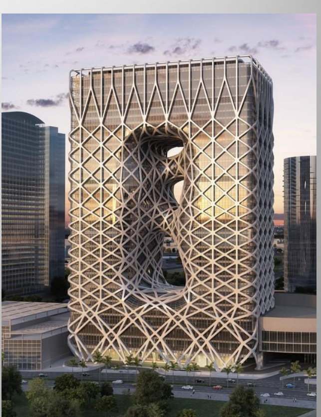
City of Dreams Zaha Hadid, 2014