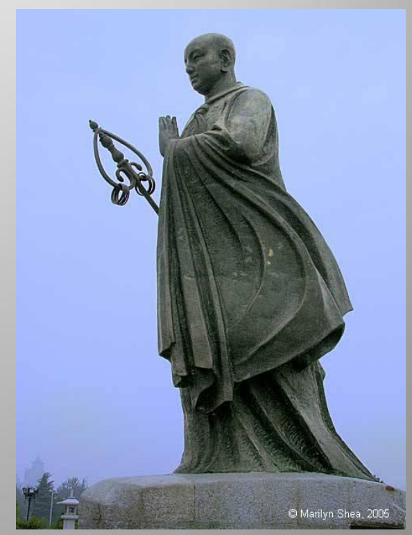
Statue of Xuanzang, bronze