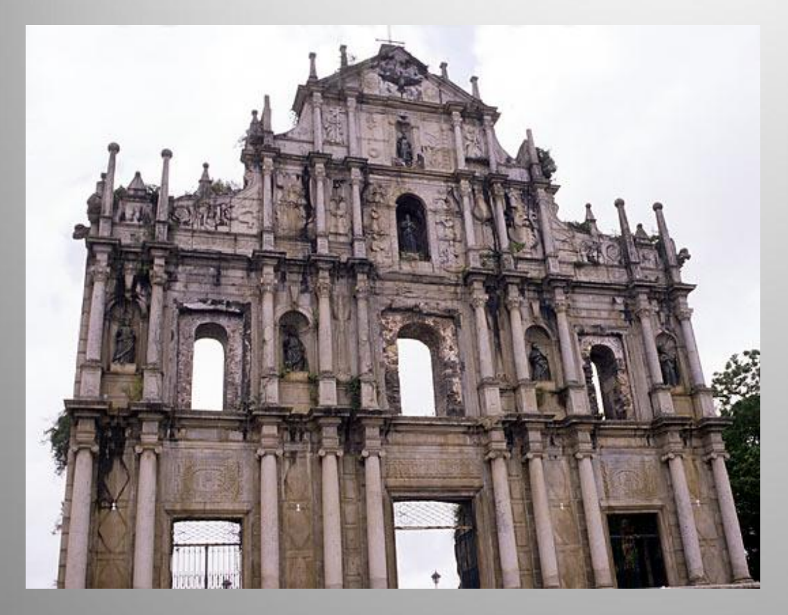
St. Paul's Cathedral, 17<sup>th</sup> century