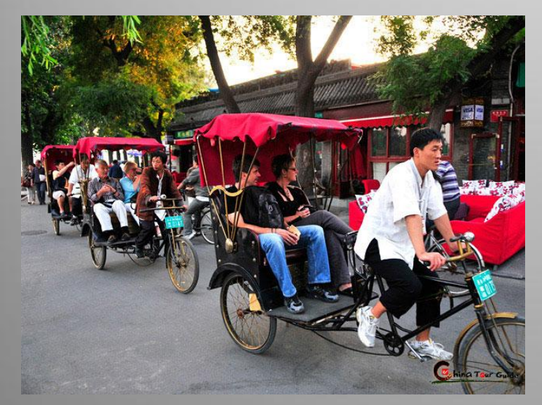
Refurbished Hutongs, 14th c. and later