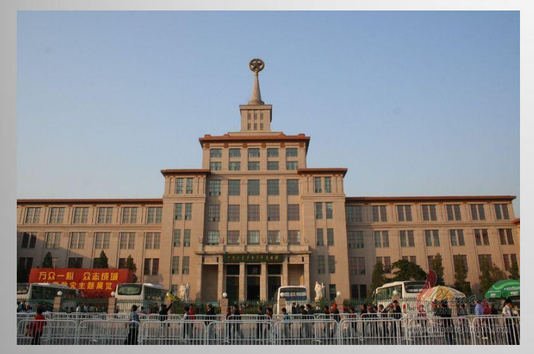
Military Museum of the Chinese People's Revolution, 1958