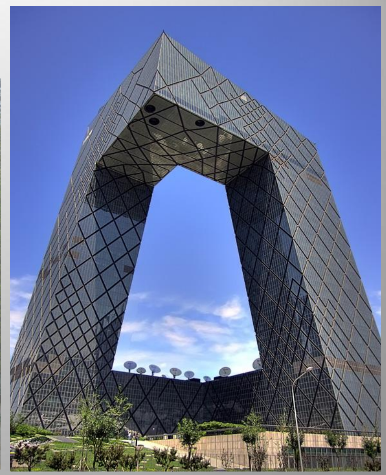
CCTV Tower , 2012 Rem Koolhaas