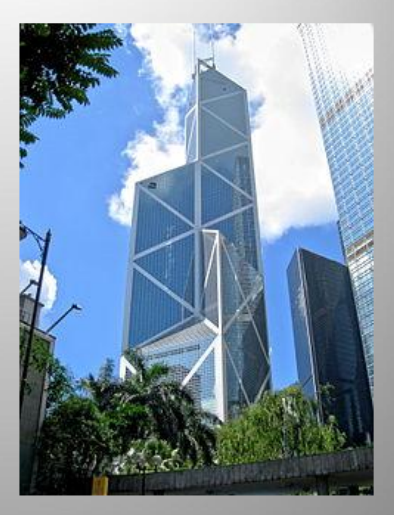
Bank of China Tower, 1033 'I. M. Pei, 1990