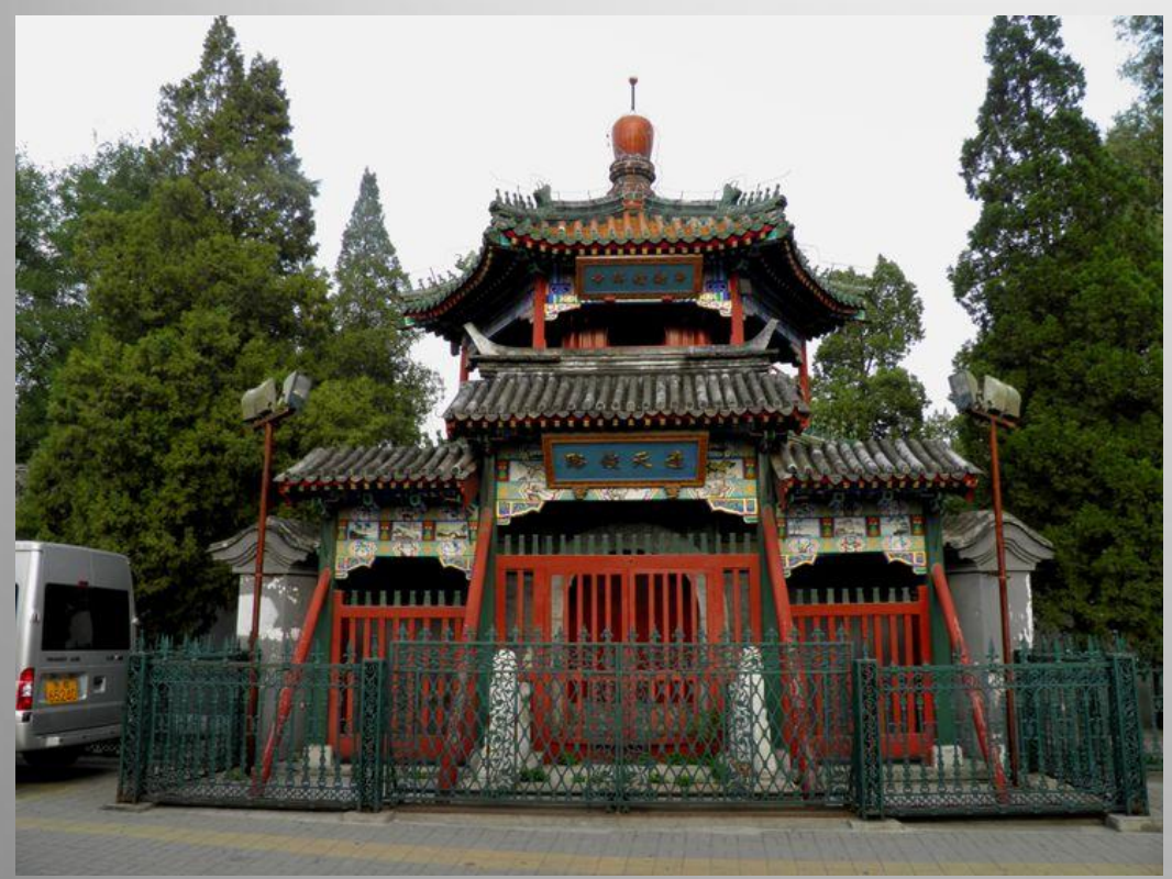
Niujie Mosque, 10<sup>th</sup> century CCTV Tov Rem Koo