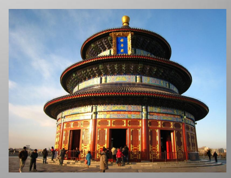
Temple of Heaven , 15<sup>th</sup> century, Ming Dynasty