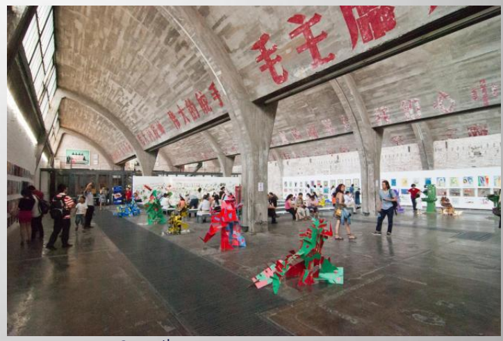
Factory 798, 20th century, 1950s