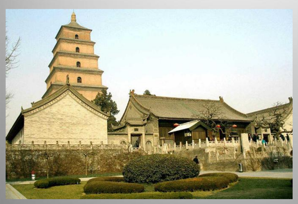
Great Wild Goose Pagoda and Da'cien Temple , 7<sup>th</sup> c.