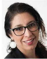
ACKNOWLEDGEMENTS JEANETTE ROJAS