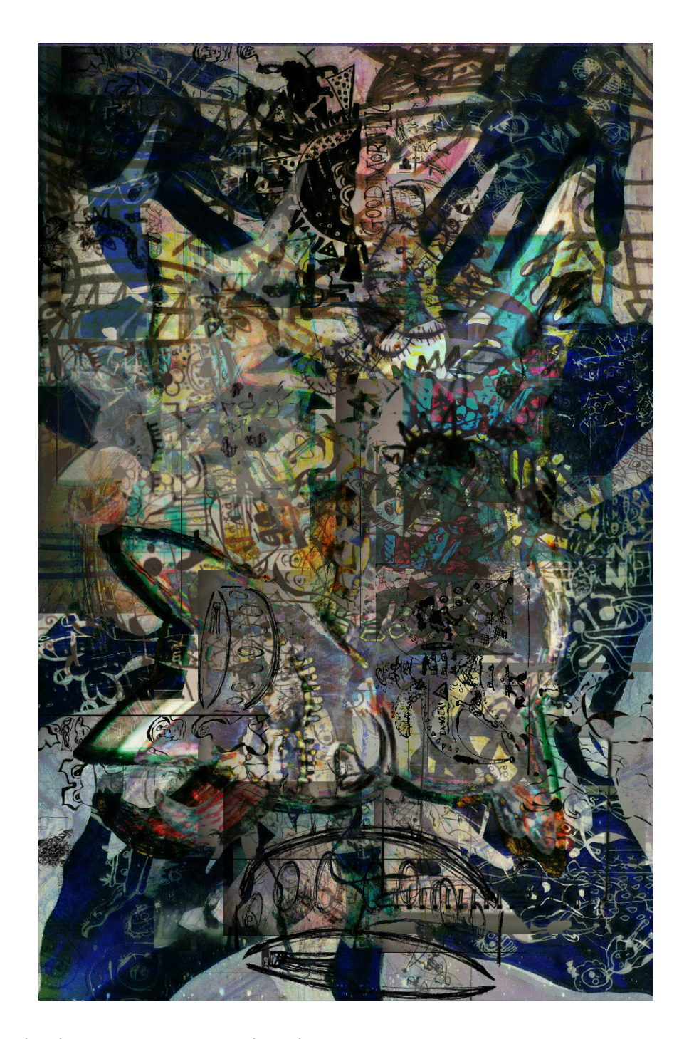
Mishipeshu Hands of Time in Copper