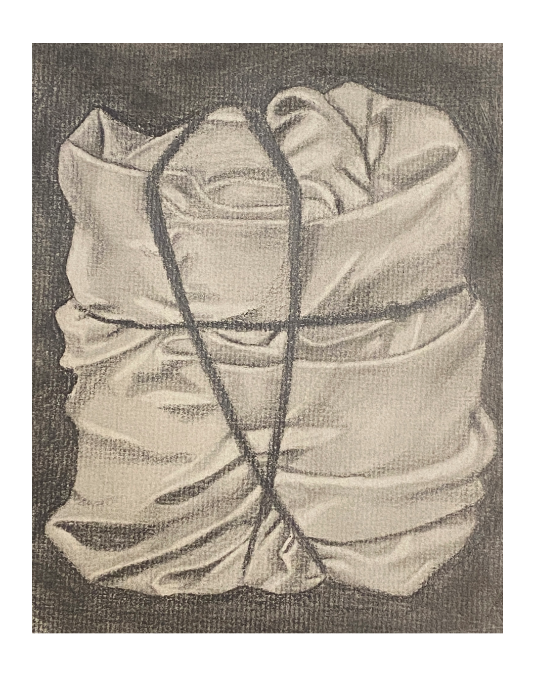
Still Life with Drapery