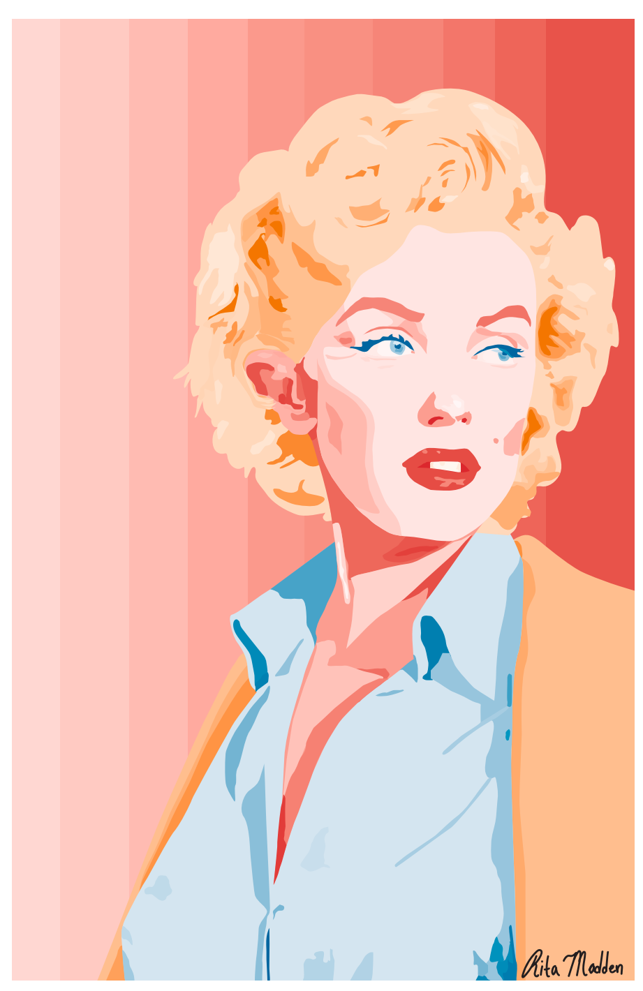
Color Limitations with Marilyn Monroe