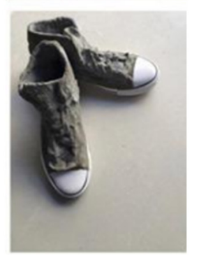
In Cemento Veritas