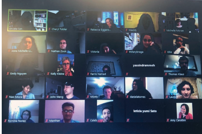
Zoom screen shots of Skoal 2020