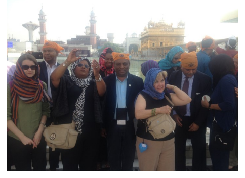
Top: Sister City signing with Montgomery County Executive and Mayor of Hyderabad, India