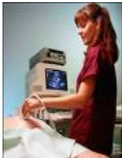
Diagnostic Medical Sonography