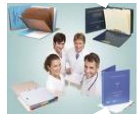
Health Information Management