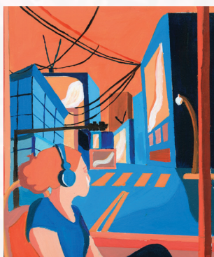
Student Work by Perez, M