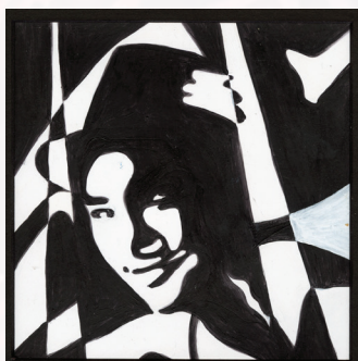
Student Work by Chucha, S