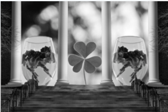
Student Work by Zelaya, K