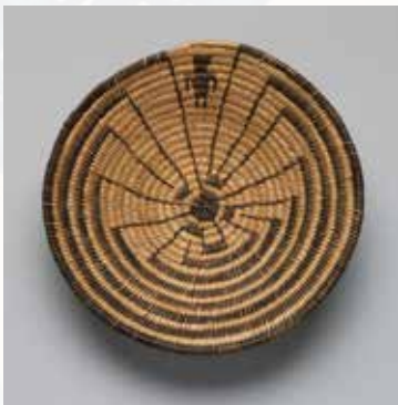
Native Northamerican- Akimel O'odham (Pima)