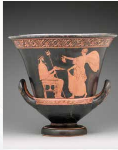
Greek- Red-figure Calyx Krater