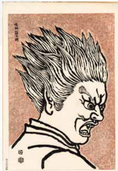
Japanese- Ito Nisaburo: Vajra God Copy