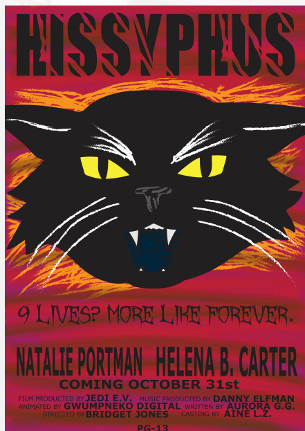
Student work by Sy, A