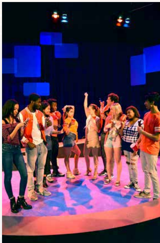
GOOD KIDS presented by Visual and Performing Arts Department

POSTER DESIGN BY GRAPHIC DESIGN AFA STUDENT ALWIN MATHEW THOMAS