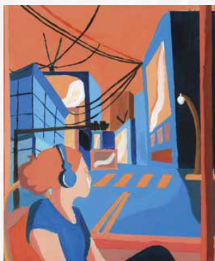
Student Work by Perez, M