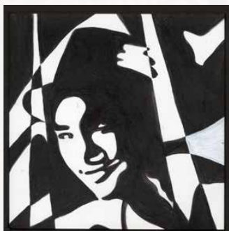
Student Work by Chucha, S