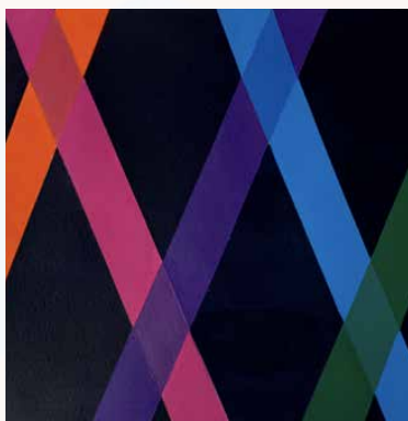
Student work by Amelia, V