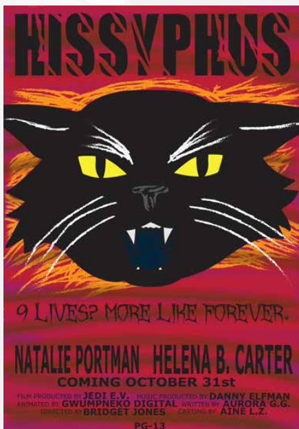
Student work by Sy, A