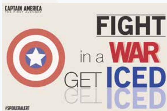
Student work by Crater, K