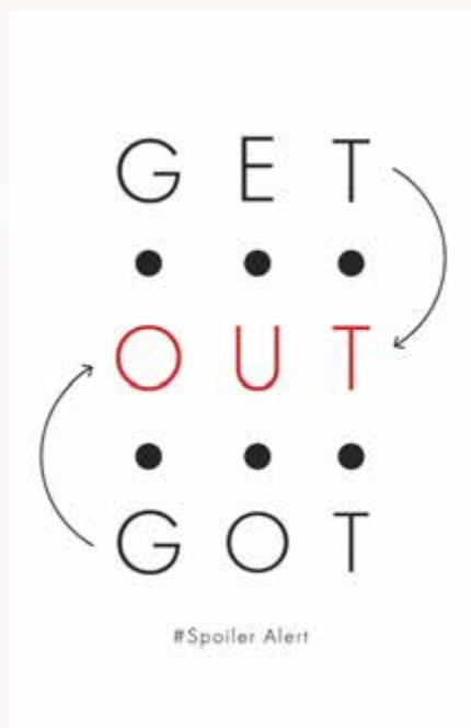
Student work by White, I