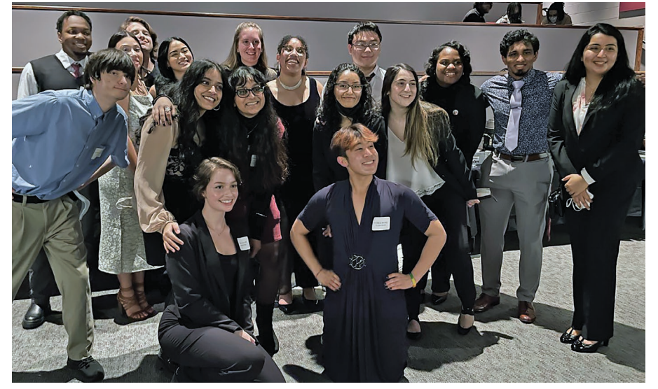
Class of 2022 on the night of the Colloquium