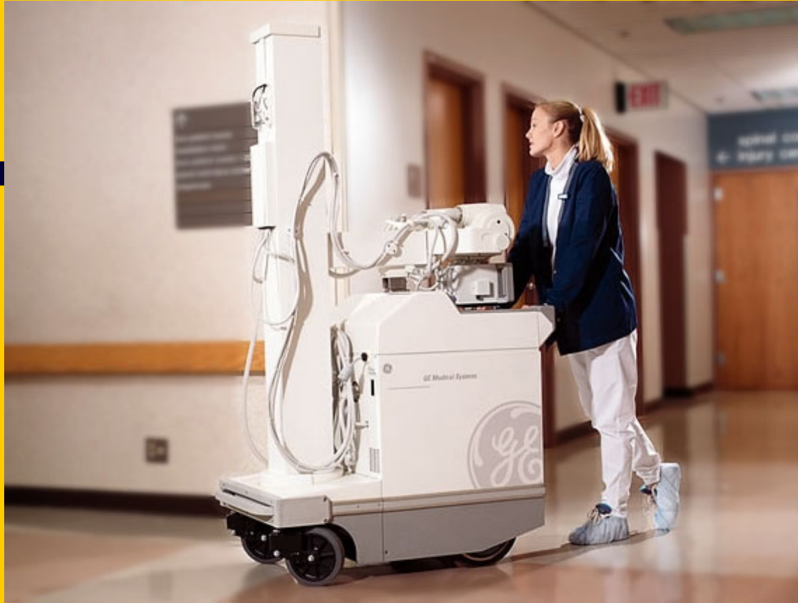
Taking Portable x-ray images