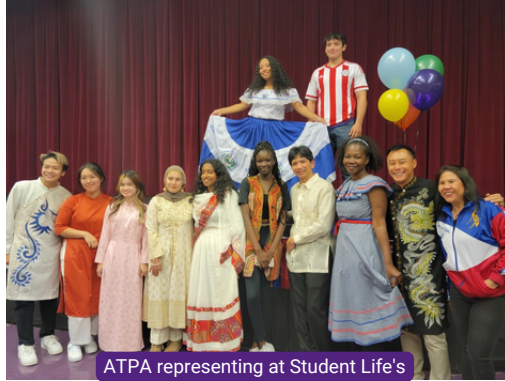
International Education Festival