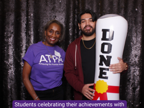
Students celebrating their achievements with coaches at ATPA's End-of-Year Celebration