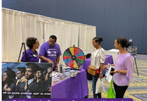
MC Tabling at the Empower Community Weekend to for foster connections with East African communities