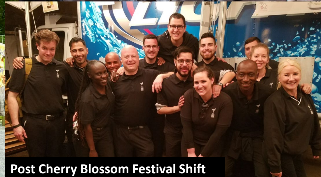
Post Cherry Blossom Festival Shift