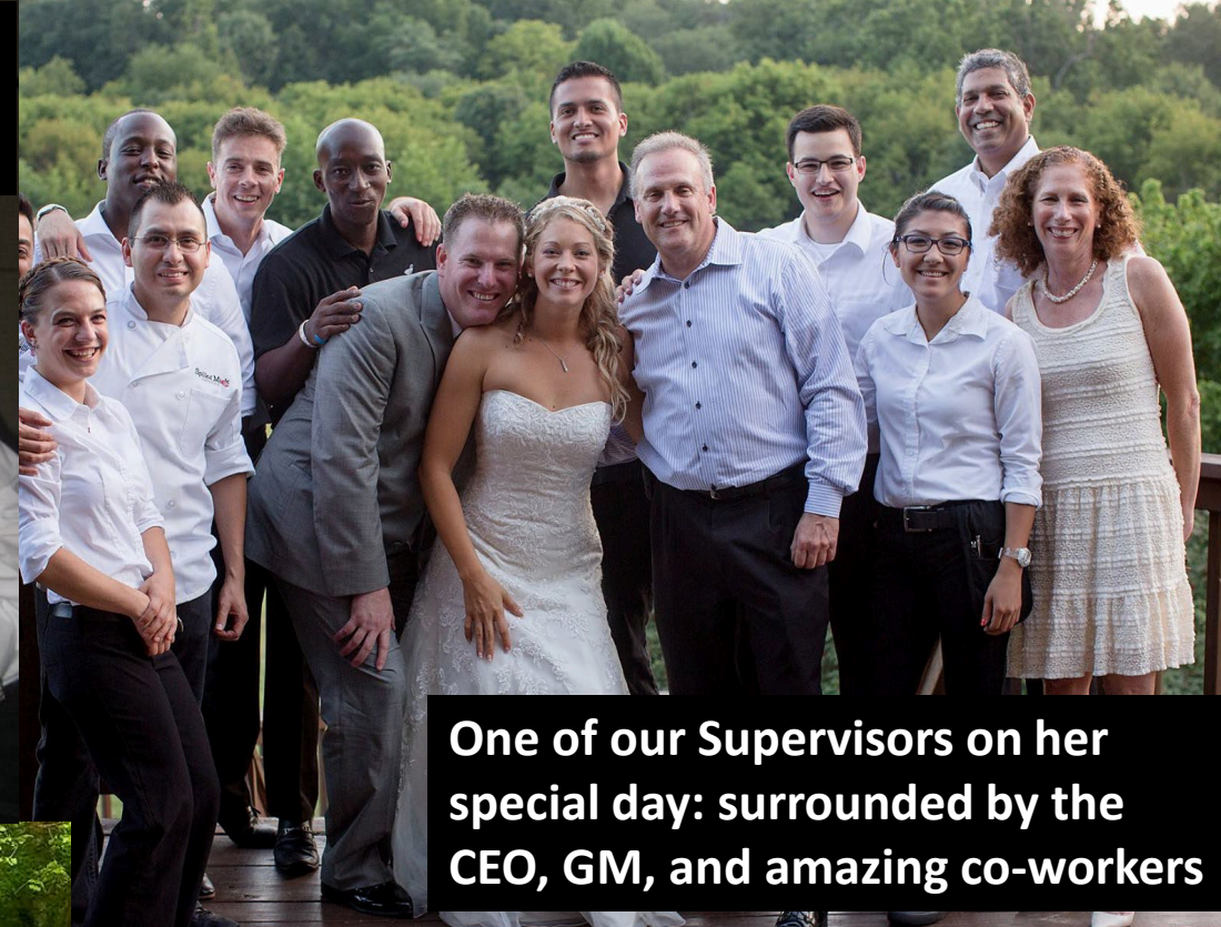
One of our Supervisors on her special day: surrounded by the CEO, GM, and amazing co-workers