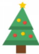
Advent Calendar (b...

Create vertically stacked expandable items