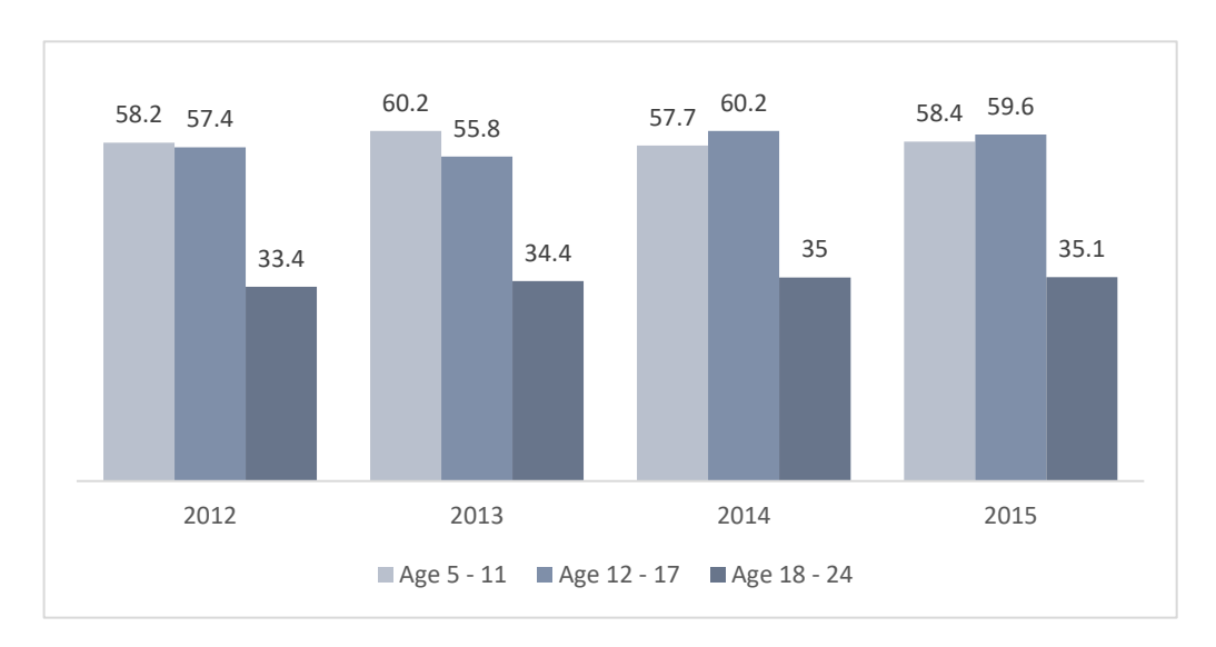
Figure 1 Children, adolescents, and adults who used the oral health care system in the past year

According to Healthy People 2020, one of the high priority issues regarding oral health is the number of individuals who use dental health services in the United States. Data from Healthy People 2020 suggests that adults' ages 18-45 who visited the dentist in 2015 is only 35%. Individuals with poor oral health are at risk for diseases such as dental cavities, gum disease, gingivitis, infection, and oral cancer. Oral health conditions are linked to systemic conditions, such as heart disease, pneumonia, osteoporosis, osteopenia, diabetes, and HPV. Healthy People 2020 is striving to improve the number of individuals going to the dentist by at least 10% by 2020.