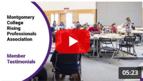
MCRPA Member Testimonials