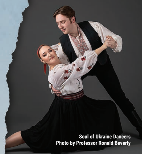
Soul of Ukraine Dancers