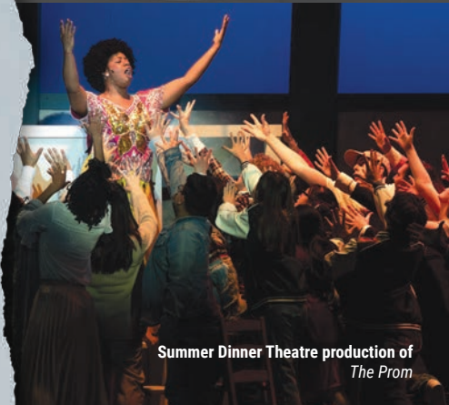
Summer Dinner Theatre production of The Prom