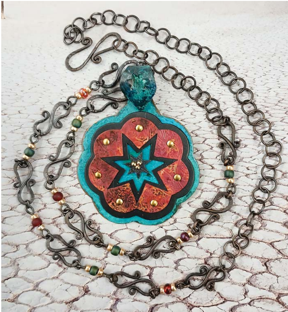
Artist: Jeanne Stone ■ Title: Blazing Stars

Course: ADS492 15 Hours $124 + $105 fee = $229; Non-MD Residents add $140